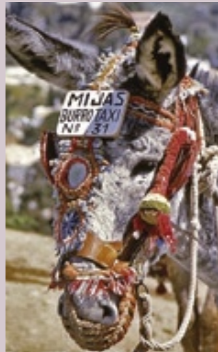
ABOVE: A 'donkey taxi' in Spain BELOW: An injured bull during a bullfight in Spain RIGHT: A caged lion in a zoo in Thailand

This leaflet guides you on steps to take to be a compassionate traveller, and offers advice on how to react to any ill treatment you may be confronted with.