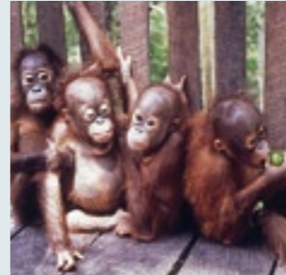
ABOVE: Young orangutans in a sanctuary in Indonesia BELOW: A young chimpanzee posing for photographs with a tourist at a beach resort